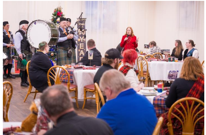
Alaska Celtic Pipes and Drums performed an amazing set for us, including Christmas Carols!