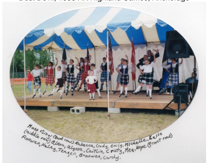
Massed Fling at 2000 AK Highland Games in Eagle River.