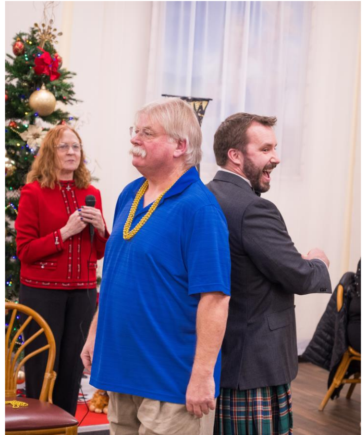
Down to the final two in Heads and Tails (renamed Crowns and Kilts)