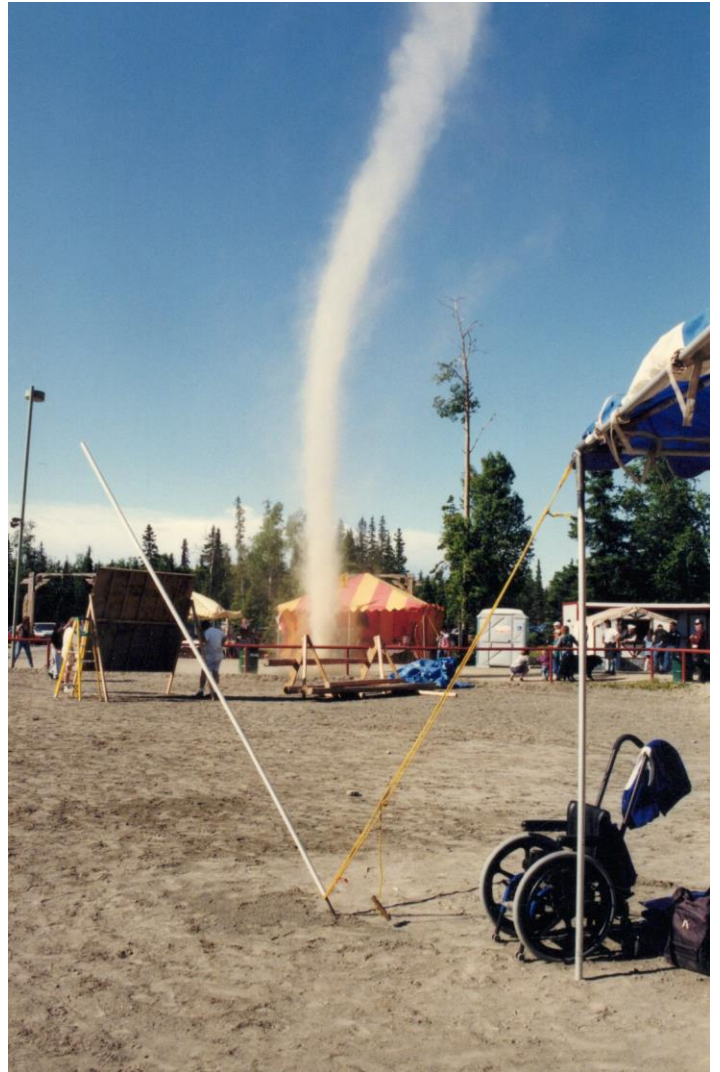
Dust Devil, 1996 AK Highland Games, Anchorage