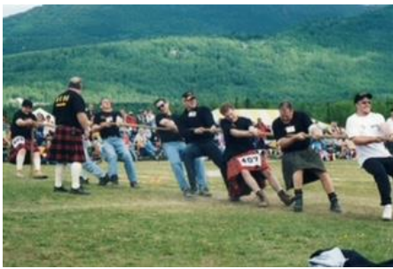
BEMA Construction Tug-O-War Team. They won a number of Championship in the mid 90's