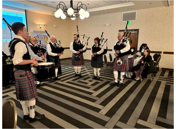
Anchorage Scottish Pipe Band presented a program of Burns tunes and a salute to the military.