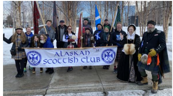
2022 Fur Rondy Parade participants

Frostbite Footrace & Costume Fun Run: We will be walking the 2.5k Costume Fun Run. Race is at 9:30 am. Our costume theme will be "Nessie Hunters," and we'll even have Nessie with us! After the run, Nessie and the hunters will join the parade contingent for a second circuit of the route.